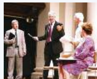
Actors playing UDHR drafters René Cassin, John Peters Humphrey and Eleanor Roosevelt

We had invited diplomats from the embassies of those states that had participated in the vote to play out the roles of their predecessors. This they did with evident enjoyment. The El Salvador ambassador's daughter, born on Human Rights Day, waved a voting card on behalf of her country; and a Thai diplomat blinked when he saw that his card read 'Siam'. The Lebanese delegate had actually known Charles Malik – one of the declaration's founding fathers and a character in the play. And representatives of Poland and the former Czechoslovakia changed history, by brandishing their voting cards theatrically despite their countries' refusal to vote for the declaration in 1948.