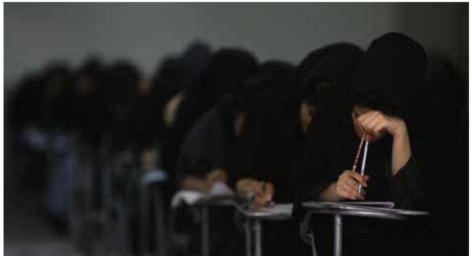
Iranian high school students sit for their university exams in Tehran.