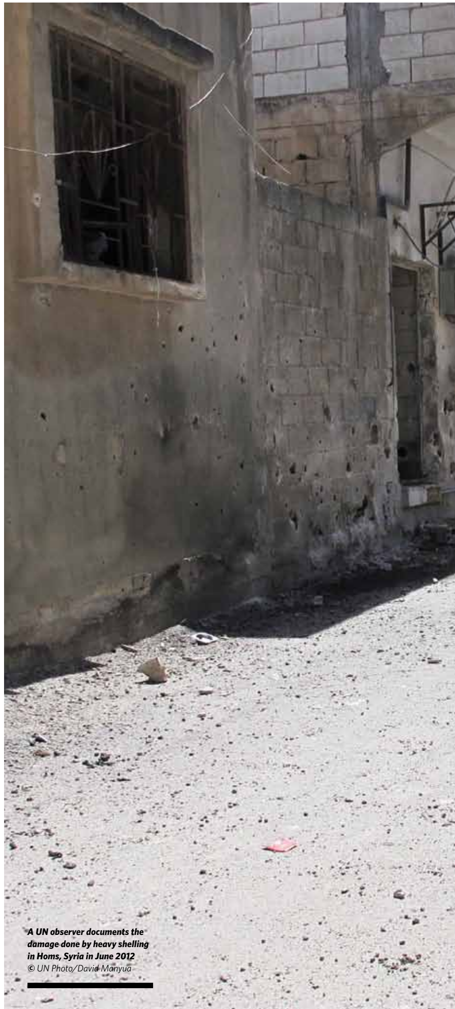
A UN observer documents the damage done by heavy shelling in Homs, Syria in June 2012

By signing up thousands more supporters, we can significantly increase our voice and impact so that UNA-UK is strengthened for all the work we have ahead of us.