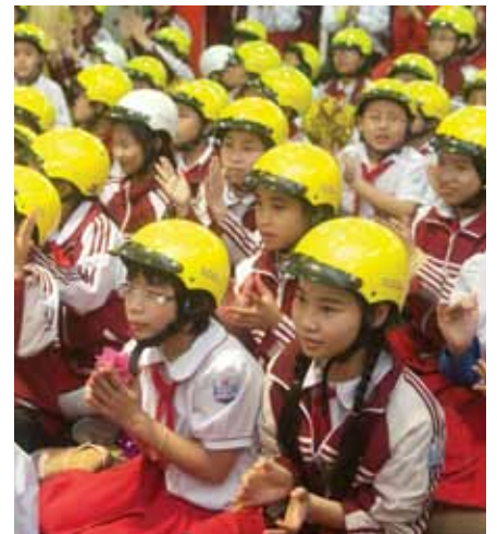
Children at Nam Trung Yen School in the Cau Giang District of Hanoi, Vietnam. As part of WHO's Road Safety in 10 countries project, Vietnam has closed loopholes in existing helmet laws to include the use of standardised, properly fastened helmets for riders of all ages

While this would be an enormous achievement, having such optimal legislation in place is only a first step. This legislation needs to be accompanied by strict enforcement, brought to the attention of the public through mass media campaigns, and backed by statements of strong political will from