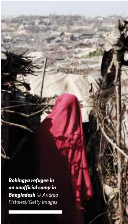
Rohingya refugee in an unofficial camp in Bangladesh