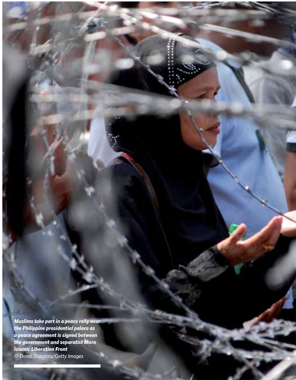
Muslims take part in a peace rally near the Philippine presidential palace as a peace agreement is signed between the government and separatist Moro Islamic Liberation Front

The media has a crucial role to play in holding governments to account and we all have a duty to be responsible media consumers. At UNA-UK, we feel this responsibility is three-fold: raising awareness of ‘invisible issues’, reflecting on trends that can get overlooked in our 24-hour news flurry, and ensuring that the UN is not forgotten.