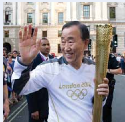
UN Secretary-General Ban Ki-moon takes part in the torch run for the London 2012 Games

I would say keep your options open. The UN system is huge. Working at the headquarters in New York may be exciting but working in the field can be immensely gratifying. If you are really set on the Secretariat, then do your research. Talking to informed staff members is very effective. There are many options available. Find out what each one entails. The most rewarding UN careers combine assignments at headquarters with international field work. ●