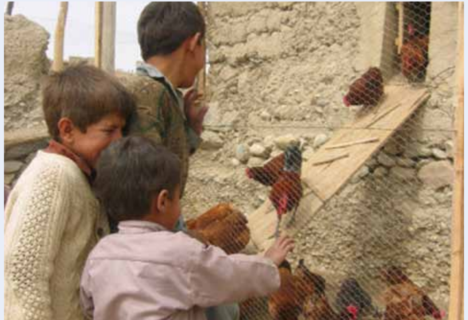
Picture from the 'Afghanistan Livelihood Project', which is supported by UNA Church Stretton and the wider community. Through the UN Refugee Agency, the project supports the retraining of returning Afghan refugees in poultry-raising and other trades

Our October forum will therefore feature examples from four local voluntary organisations engaged in humanitarian activities, whose mottos resonate with UNA-UK: Fairtrade/Traidcraft, Rotary, Stretton Climate Care and, of course, UNA Church Stretton. At least a dozen other organisations are equally well-qualified to share their experiences and they have been invited to attend.